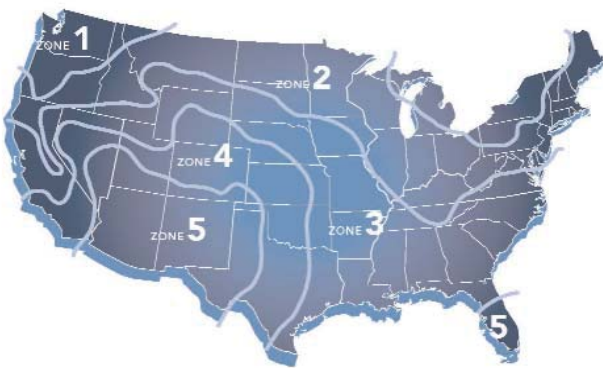
Zone Map of U.S.A